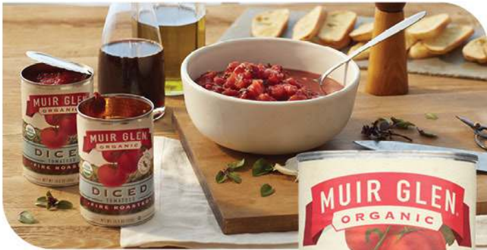
Muir Glen Organic Tomatoes (selected varieties)