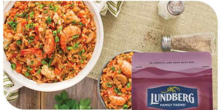
Lundberg Family Farms Rice (selected varieties)